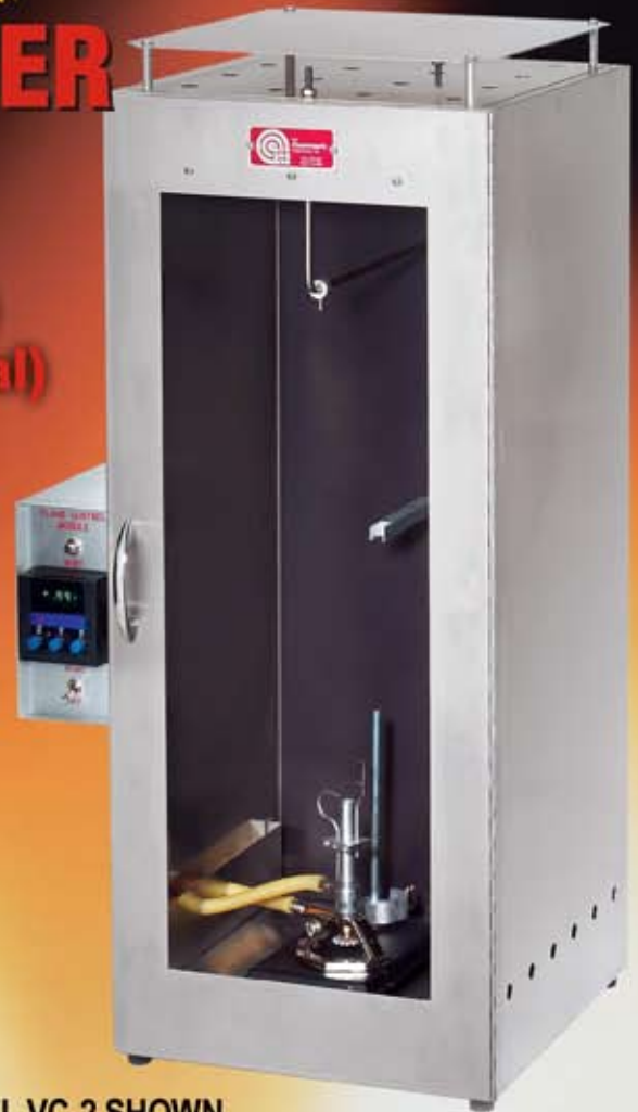
MODEL VC-2 SHOWN

TEL: +1-631-293-8944 FAX: +1-631-293-8956 Email: equipment@govmark.com Web: www.govmark.com